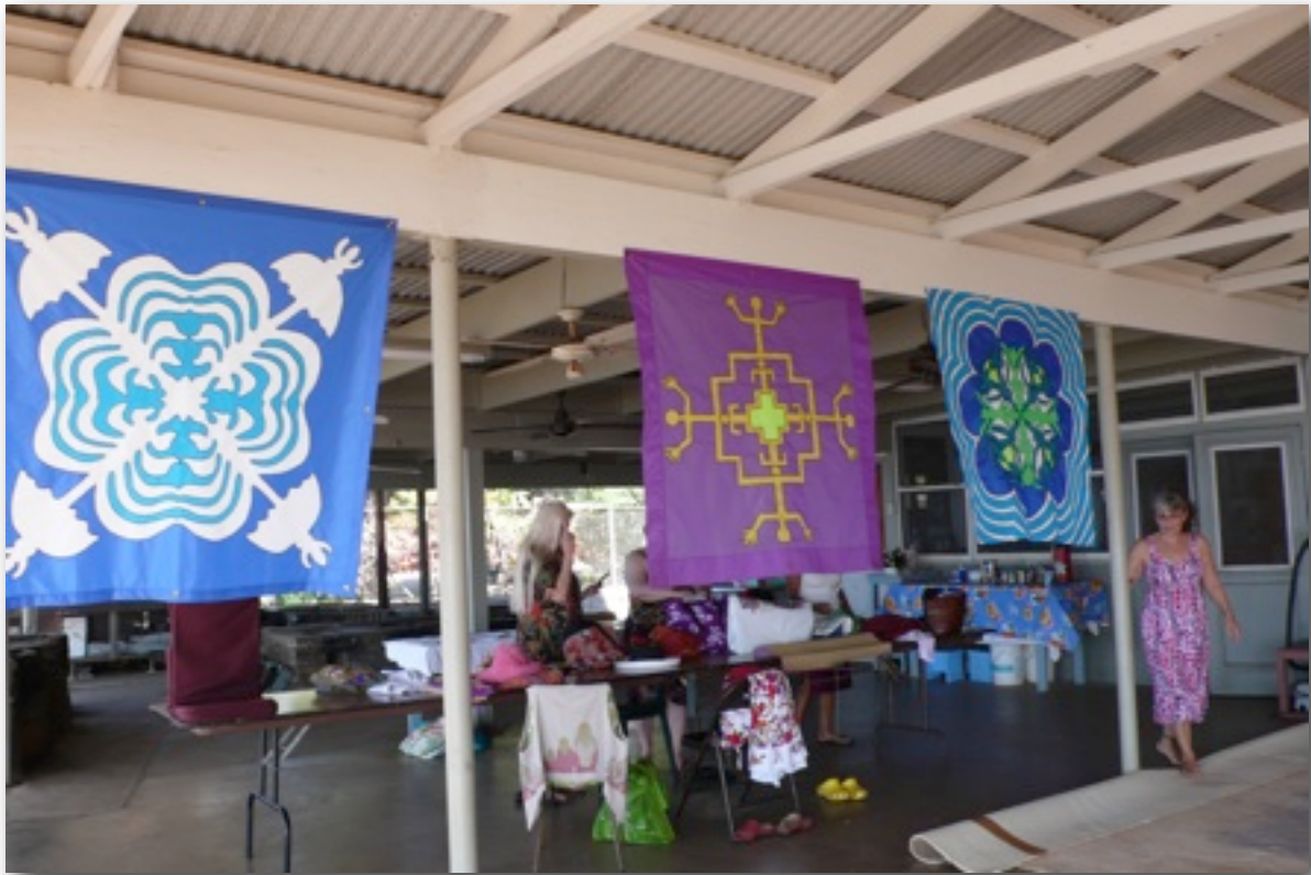
Jo Do Buddhist Mission, Lahaina