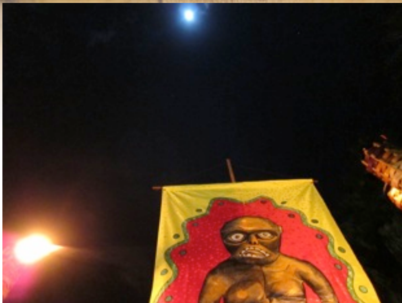
Kihawahine Full Moon Ceremony February 2012 Mo'okula Lahaina, Maui