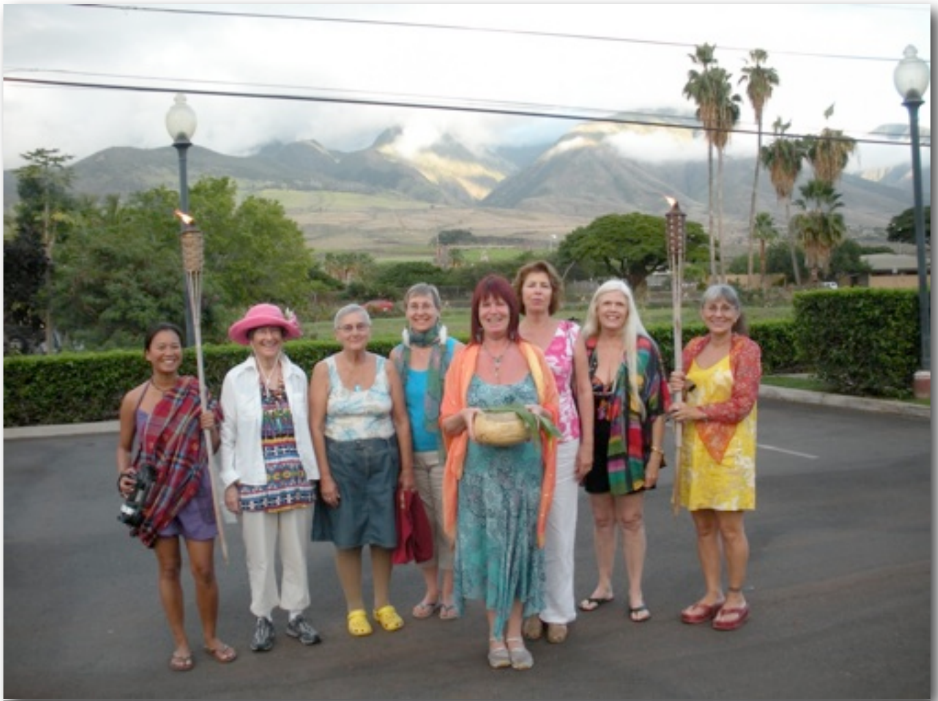
Womb With A View 2010