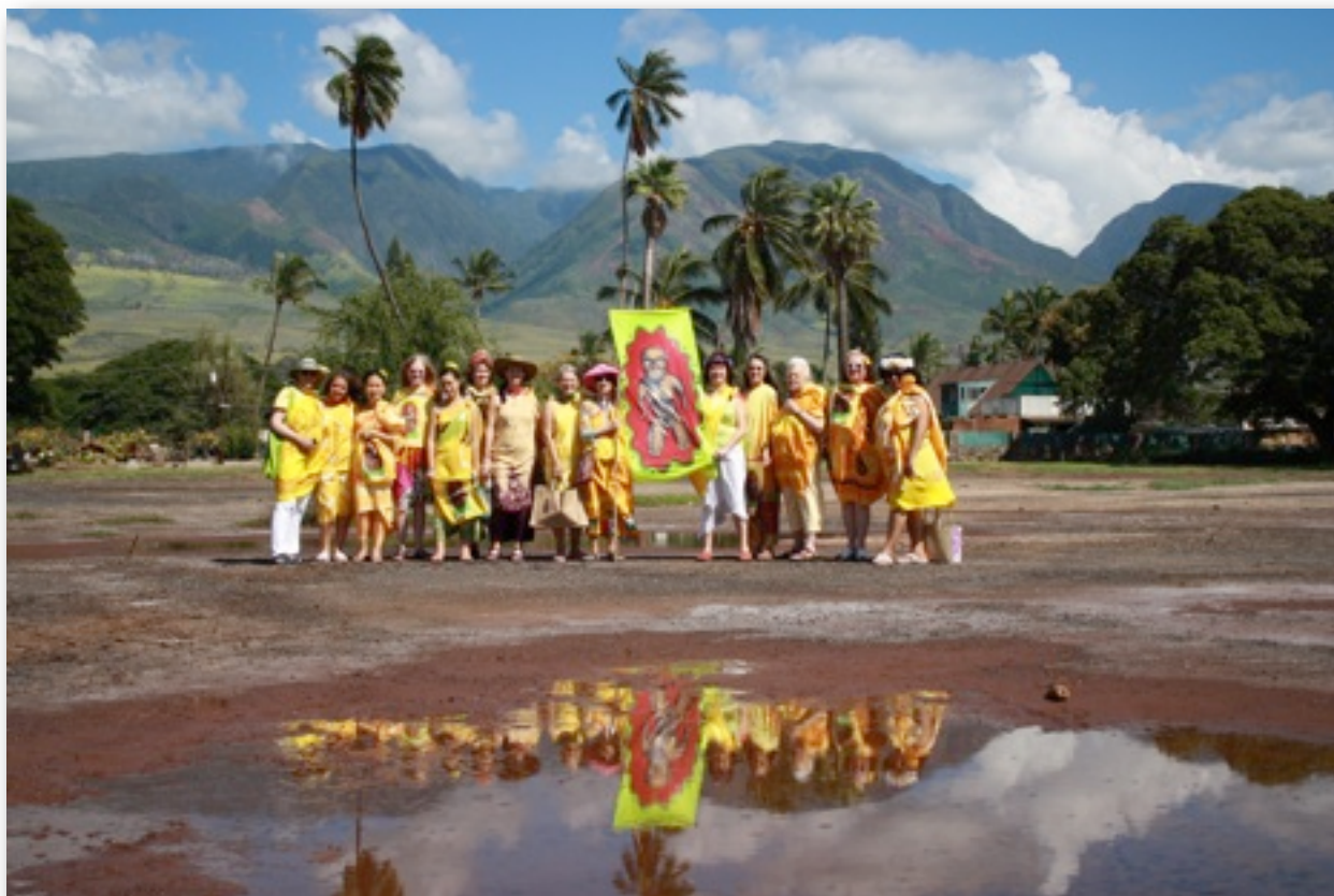
Goddess Retreat with Kihawahine / West Maui Mountains February 2011